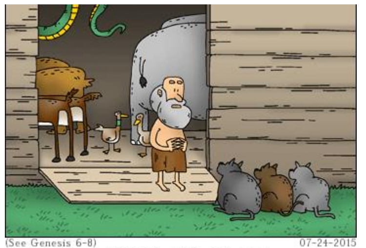
WELL BOYS, I HAVE TO SAY IT'S BEEN NICE HAVING THREE DOGS THESE PAST YEARS ... BUT NOT SO MUCH TODAY

Nexus is valued by readers and most features are read by most readers most or all of the time, so we are getting something right. The most obvious simple things to change would be slightly shorter, punchier