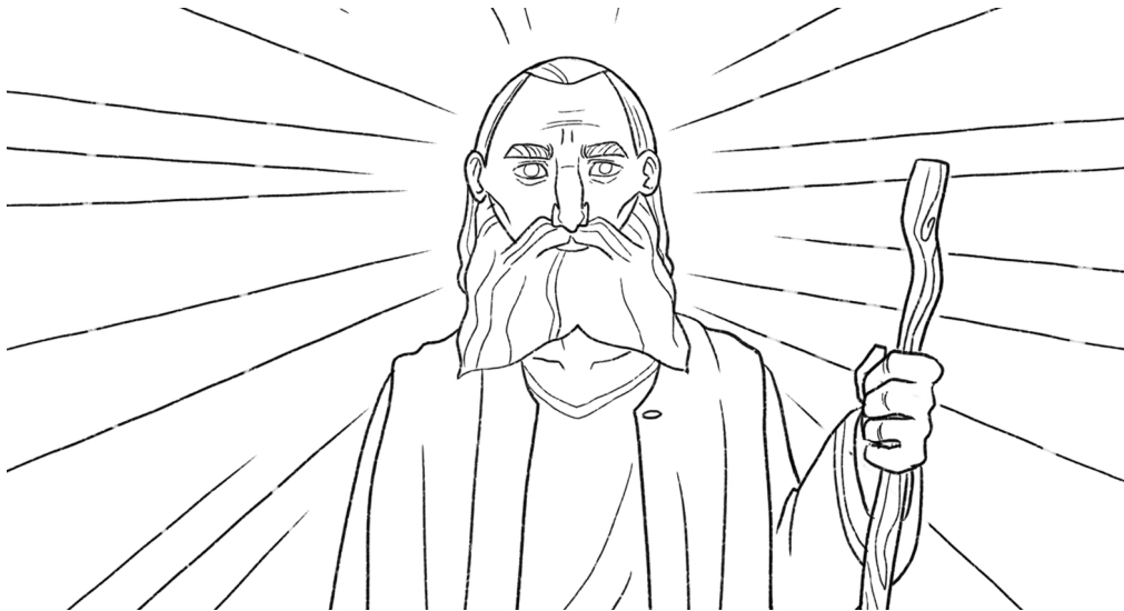
Moses' face shone brightly after meeting with God.

After speaking face-to-face with God, the skin of Moses' face shone brightly.