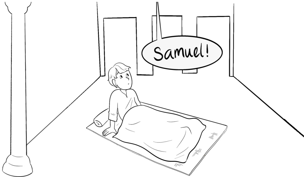
Samuel listened to God.

God speaks to Samuel and, with Eli's support, Samuel listens and is open to God.