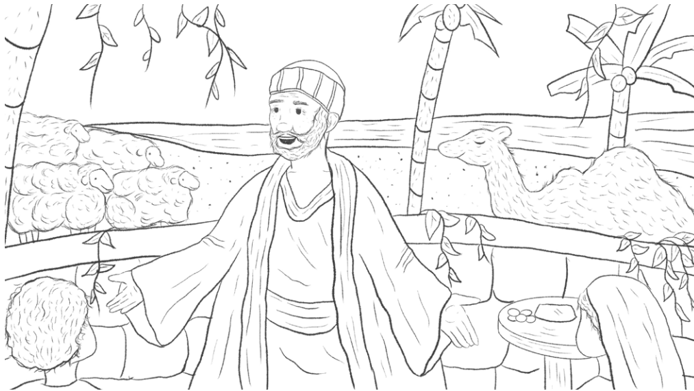
Job was blessed by God.

Job speaks with God and acknowledges God's greatness, and is blessed with more than was taken away.