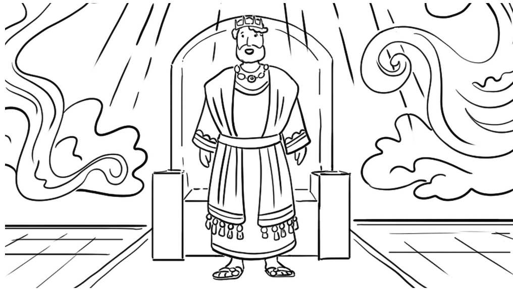
God's glory fills the Temple.

Solomon creates a special place for God to meet the people.