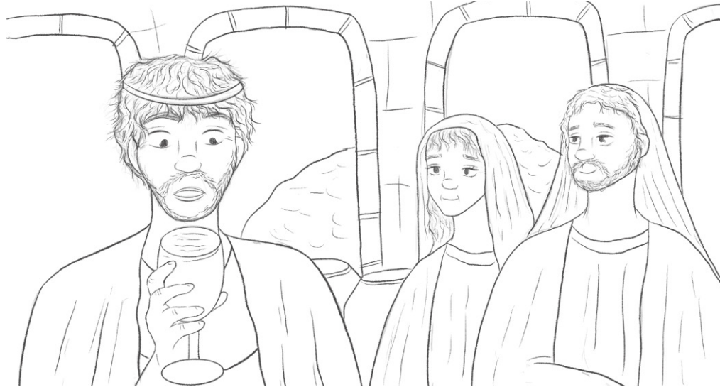
The steward is amazed when Jesus turns the water into wine.

At a wedding in Cana, Jesus performs his first miracle, turning water into wine.