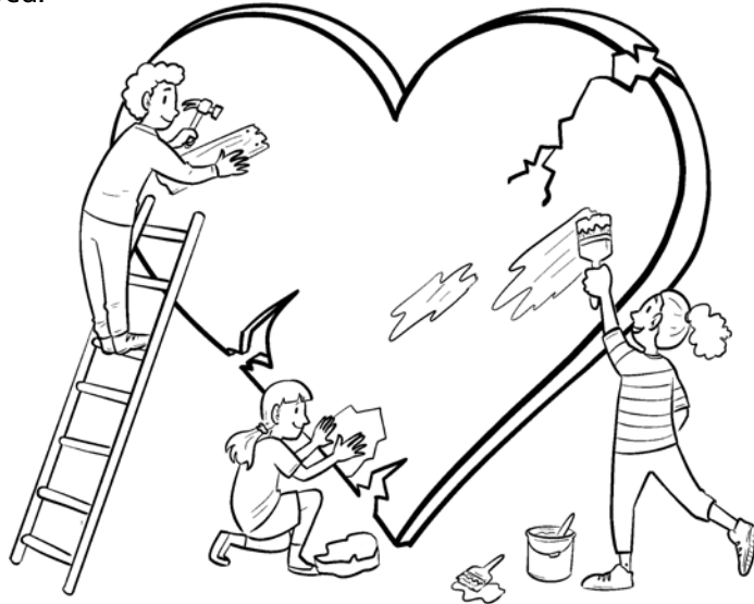
Making things new.

God gives Peter a vision, helping him to understand that God loves everyone – all can be saved.