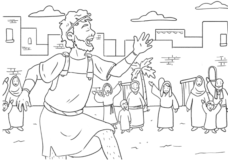
David danced before God.

The Israelites, led by David, worship God with a carnival of praise as they bring the holy Ark to Jerusalem.