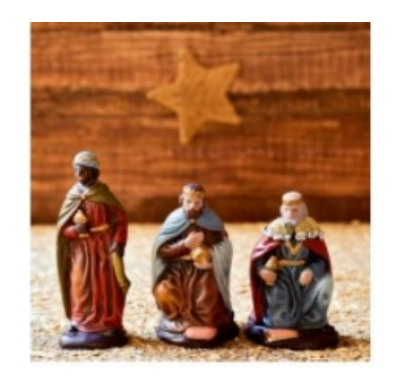
Twelfth Night Door Blessing

To celebrate the visit of the wise men to the Holy Family, some people like to ask God to bless their homes.