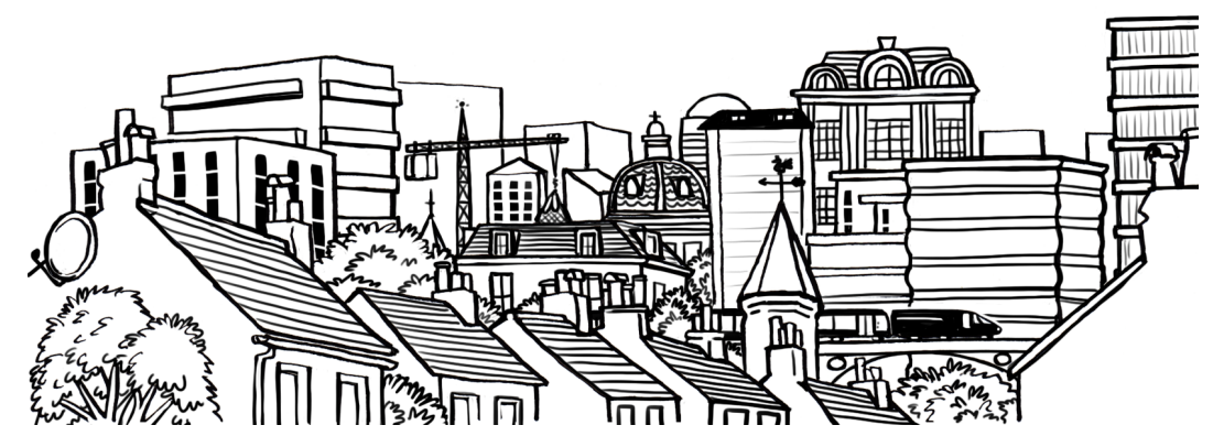
© ROOTS for Churches Ltd Weekly worship and learning resources at www.rootsontheweb.com

Draw yourself shouting the good news about Jesus from the rooftops.