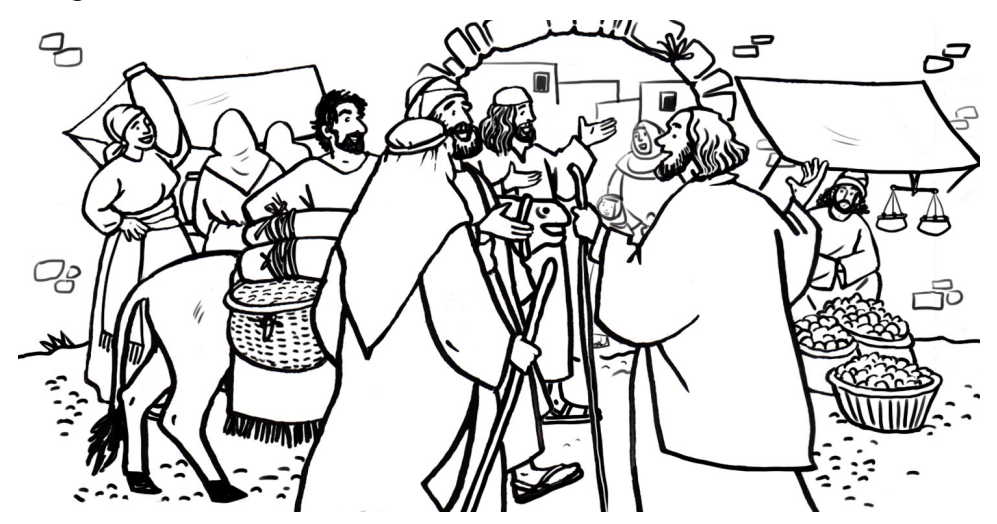
The disciples travelled to tell people about Jesus. Where could you share Jesus' story?

We must share the story of Jesus with others, it is risky, but God's spirit will guide us.