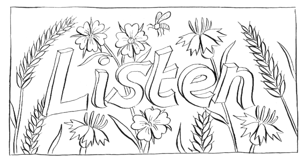
God is always speaking, are we ready to hear and respond?

God is always speaking to us, are we ready to respond to it?